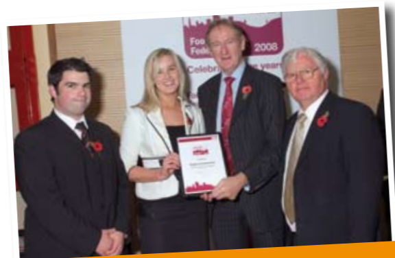
CPA Winner 2008 Dunbia.