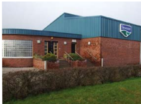
New Facility at Stevenson & Co.

Full review on the new pork facility in Issue 9 of 'One'.